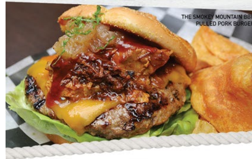
THE SMOKEY MOUNTAIN BBQ PULLED PORK BURGER

Apple wood smoked bacon and aged cheddar with lettuce, tomato and onions. M-mmm.