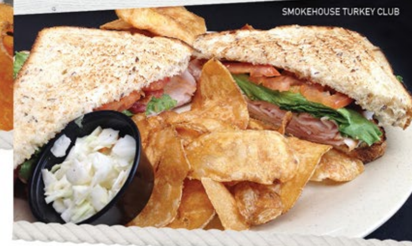
SMOKEHOUSE TURKEY CLUB

All our burgers are cooked medium unless otherwise requested